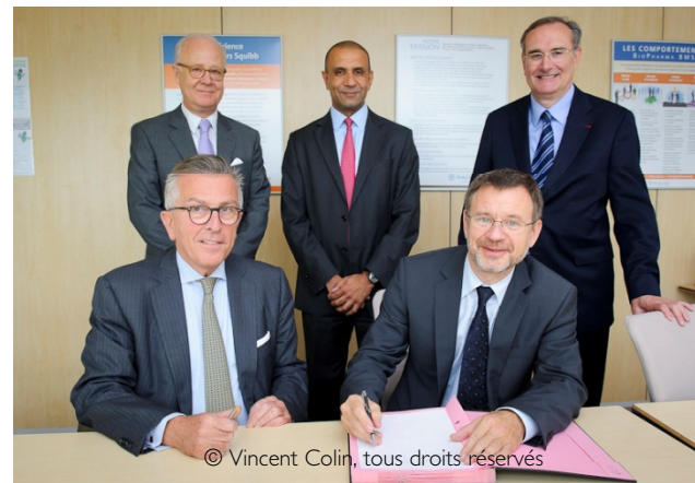
Signing of the agreement at BMS France

Bristol-Myers Squibb will fund the development of IPH2102, make an upfront payment of $35 million and additional payments of up to $430 million, depending on the achievement of pre-specified milestones during the development and commercialization period, as well as pre-specified tiered double-digit royalty payments on worldwide net sales.